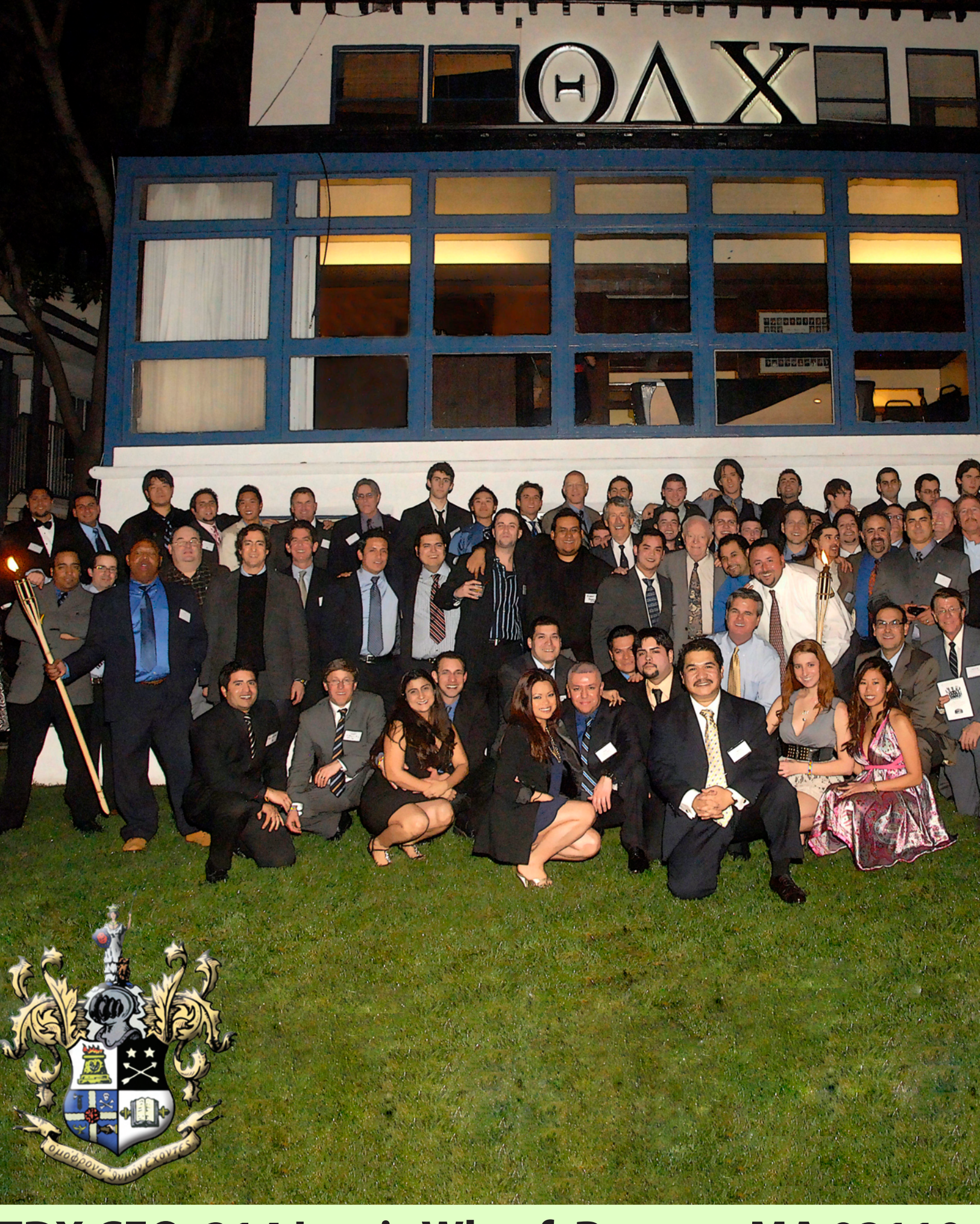
TDX CFO, 214 Lewis Wharf, Boston, MA 02110