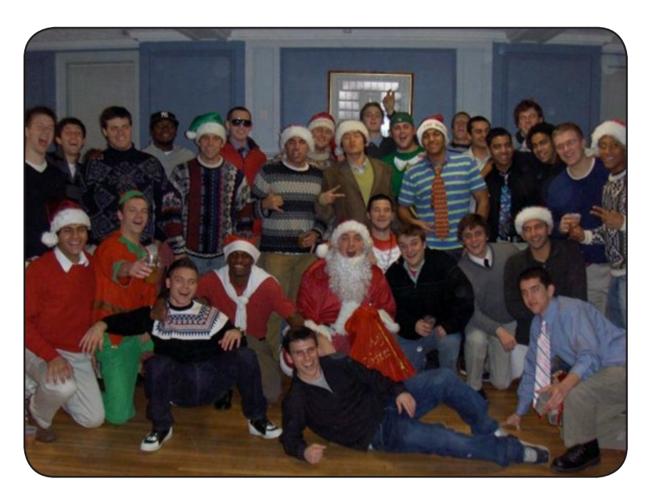
Brothers of Sigma Deuteron

still have some debts to cover but more involved on campus and in fraternity Council President to camour community, putting to good use our rising numbers. Our fraternity GPA was 3.125 over the year and ranked in the top half of fraternities on campus. Our focus on education, community, and brotherhood will surely make this coming year one to remember.