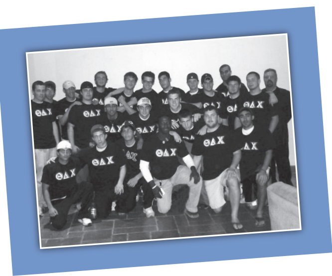
The men of the Tau Triton colony at Marist College in Poughkeepsie, NY show off their new Theta Delta Chi shirts.

Their addition and installation has been a perfect capstone to a phenomenal year for Theta Delta Chi. We look forward to a bridging of young and old when we formally present their Charter at this summer's Convention in Charlottesville, an event to commemorate the Nu Charge's 150 year anniversary at the University of Virginia.